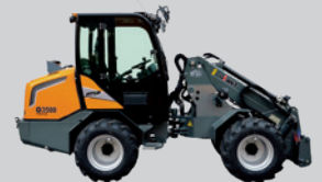
G3500 (X-TRA / TELE)