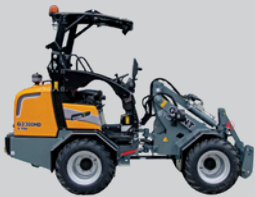
G2300 (X-TRA) HD