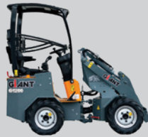
G1100 (TELE) G1200 (TELE)