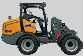
G5000 (X-TRA / TELE)