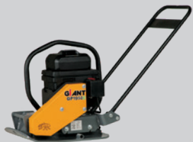
VIBRATORY PLATES E-VIBRATORY PLATS