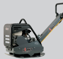
REVERSIBLE VIBRATORY PLATES E-REVERSIBLE VIBRATORY PLATES