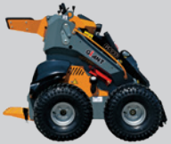
GS800G GS850T GS800 GS950T GS900

TOBROCO-GIANT has been manufacturing high-quality GIANT machines and attachments since 1996 when we opened our first factory in The Netherlands. Today, TOBROCO-GIANT offers one of the broadest product portfolios in the business with 35 different models sold in 60 countries. TOBROCO-GIANT supplies machines with service weight from 750 kg until 6.000 kg with engines from 20 hp up to 76 hp for the worldwide machine market. Which machine will you choose?