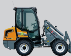
G2700 (X-TRA / TELE) HD G2700 (X-TRA / TELE) HD+ G2700E (X-TRA / TELE)