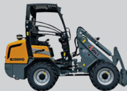
G2500 (X-TRA) HD